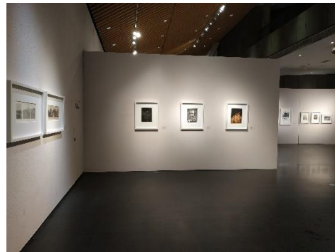
Exhibition of Association members' works at China Printmaking Museum, Guanlan