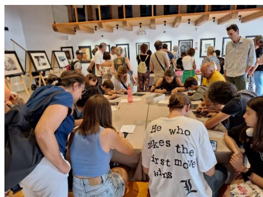
Engraving and printing workshop for visitors to an exhibition