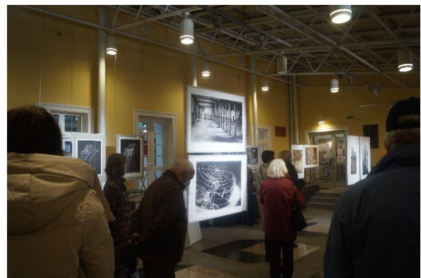
Association exhibition at Galeria Stary Ratusz, Olsztyn, Polonia