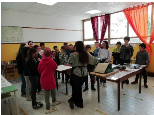
Printing lesson with students in a first grade secondary school class