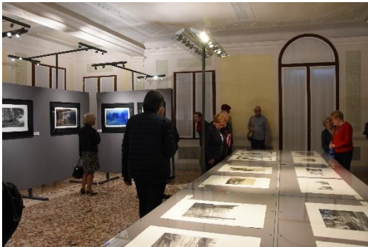
Italy-Japan exhibition at Fondazione Benetton in Treviso